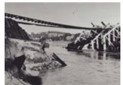
Fremantle bridge 1926

Data Analysis Australia statisticians have applied extreme value methods to a variety of problems from environmental to financial, most recently understanding maximum likely demands for electricity. Today, peak electricity demand is strongly driven by air conditioning and hence there is a need to understand the extremes in weather – temperature and humidity – and the link between such weather and electricity use. These models have helped clients lower costs and ensure more reliable systems.