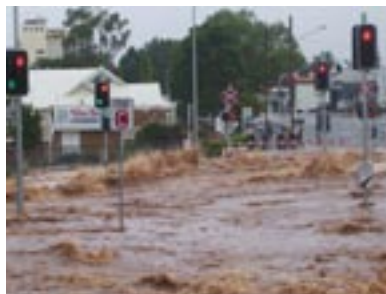
Queensland floods 2011

These questions are different from many in statistics that are concerned with averages and what is most likely to occur. (If you are coping with a cyclone, it is of no comfort to know what the average wind is, or being told that the weather is usually calm.) These different questions require